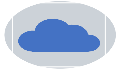
CLOUD VENDOR LIMITS