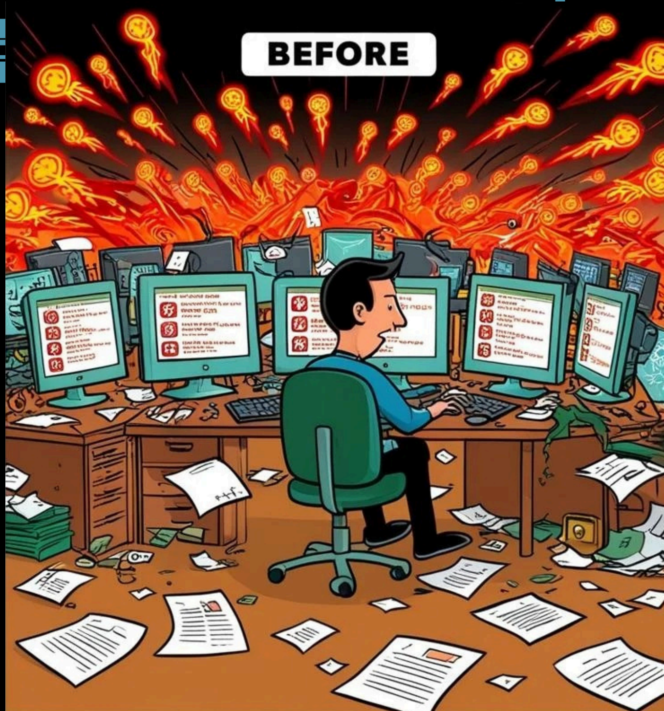
BEFORE QUMULUS: 'WHAT ON EARTH IS HAPPENING?'