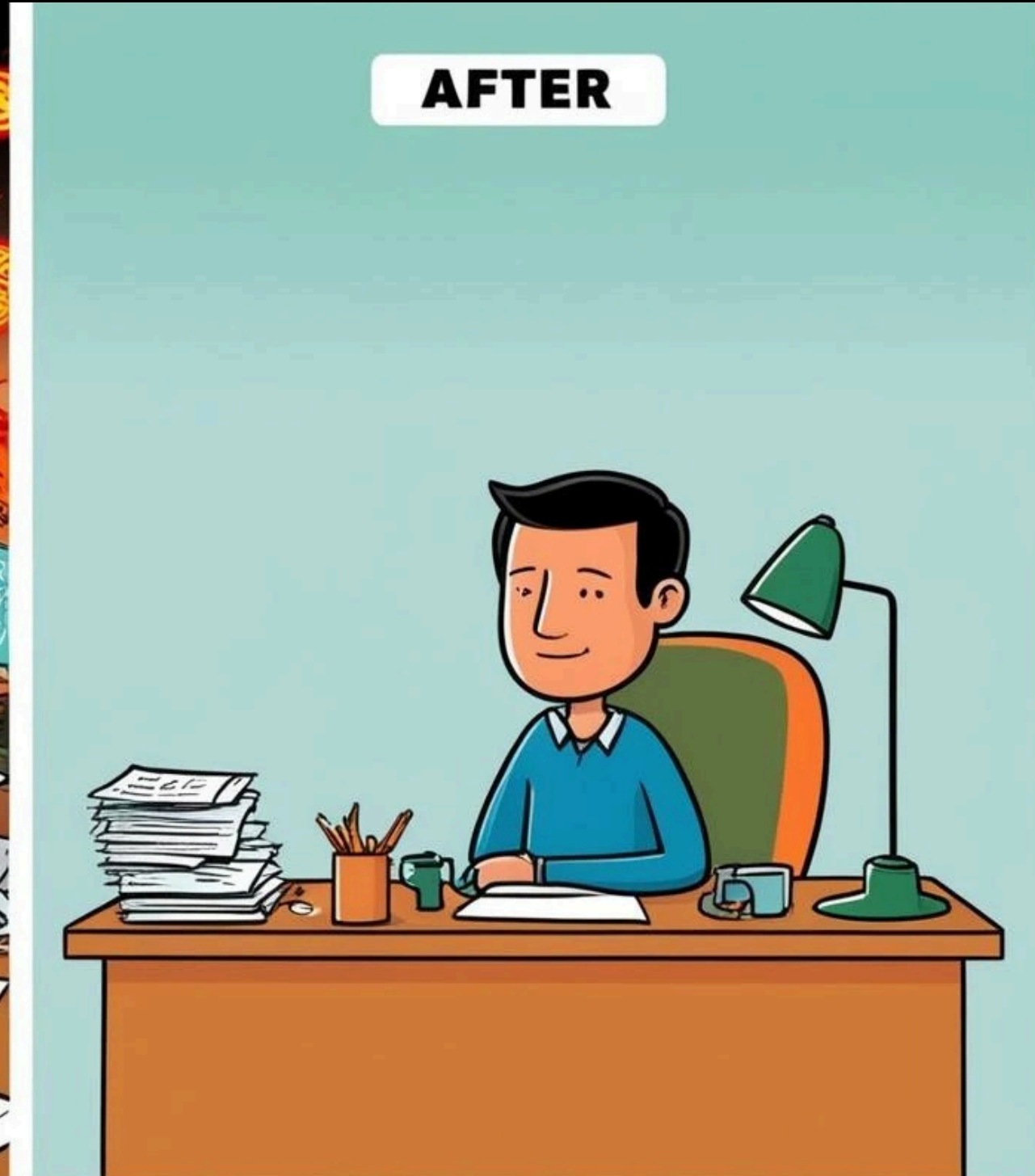
After Qumulus: 'Ah, now that's clarity!'